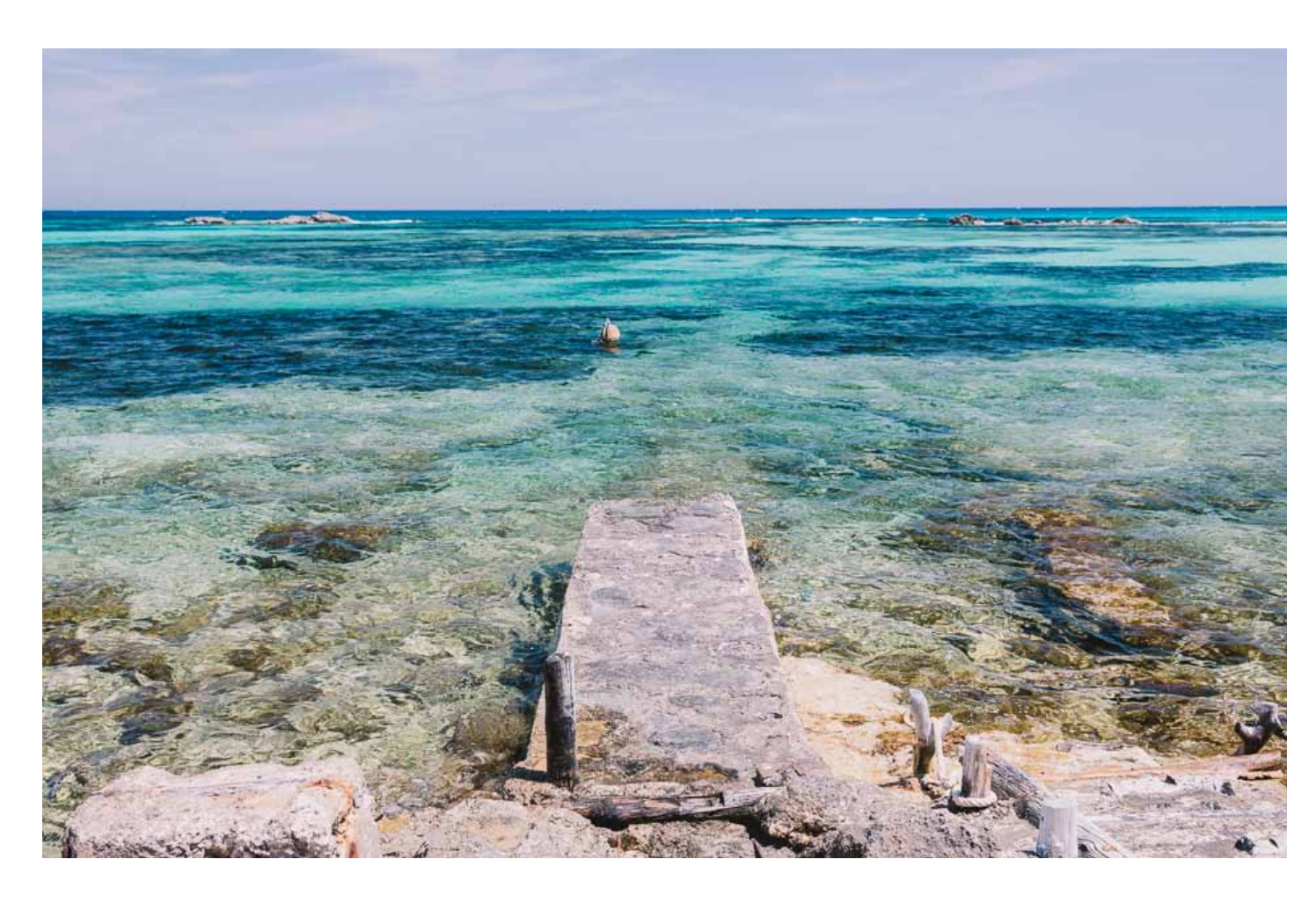
Formentera is famous for the incredible colour of the water that laps its beautiful shores. There are secret beaches and look-out points everywhere, where people set themselves up to enjoy the surroundings